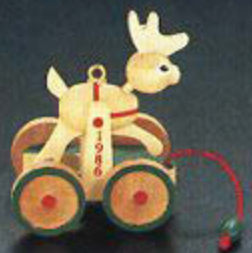
Wooden Reindeer, 3rd Ed.