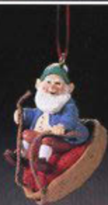
Walnut Shell Rider