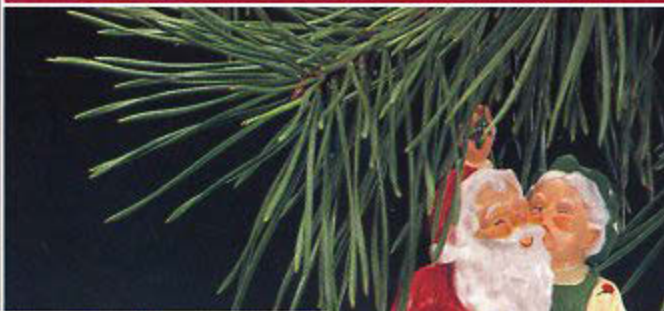
Merry Mistletoe Time 1st Ed.