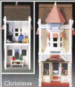
Christmas Candy Shoppe, 3rd Ed.