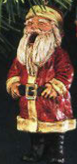
Nutcracker Santa (mouth moves)