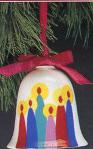
Mother and Dad