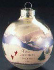
1st Christmas Together