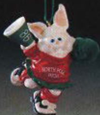
Rah Rah Rabbit