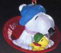
SNOOPY® and WOODSTOCK