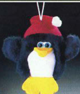
Chatty Penguin (makes squeaking noise)