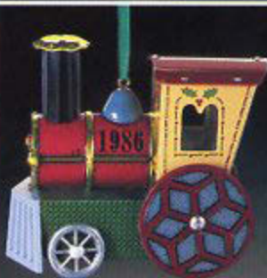
Tin Locomotive, 5th Ed.