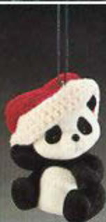
Santa's Panda Pal