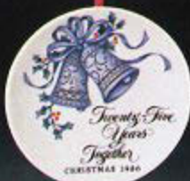
25 Years Together (plate stand included)