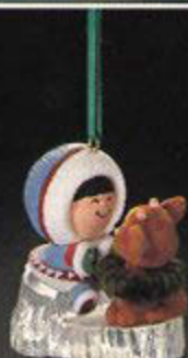
Frosty Friends, 7th Ed.