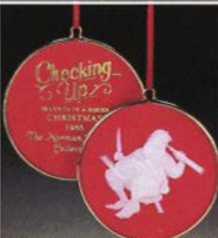
Norman Rockwell, 7th Ed.

Composition and other designs © 1986 Hallmark Cards, Inc.