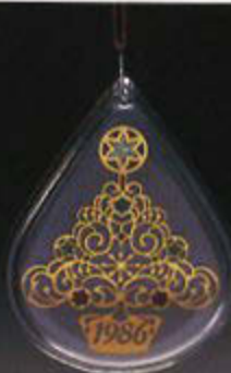
Glowing Christmas Tree