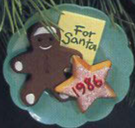
Cookies for Santa