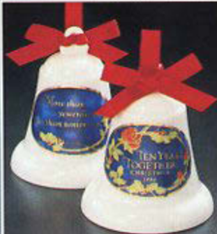
10 Years Together