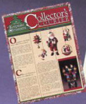
Collector's Courier newsletter