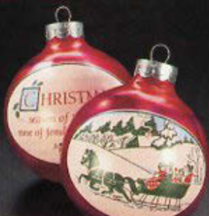
Season of the Heart