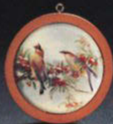
Cedar Waxwing, 5th Ed.