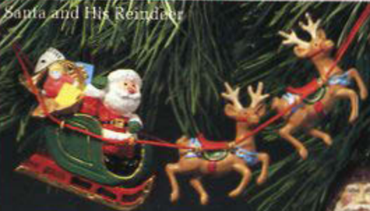
Santa and His Reindeer