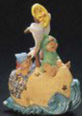
Wynken, Blynken, and Nod