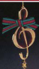
Festive Treble Clef