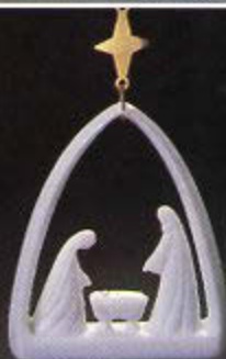
Porcelain Creche, 2nd Ed.