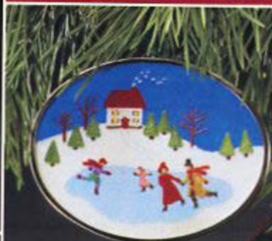
Joy of Friends