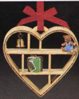
Loving Memories (space to add miniatures)