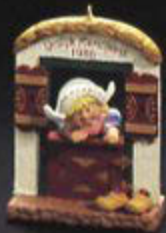
Dutch Window, 2nd Ed.