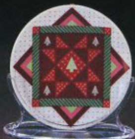
Remembering Christmas (plate stand included)

Country Treasures ornaments are crafted with a style and care that evoke fond memories of simpler times.