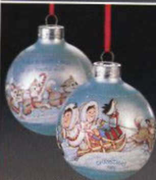
Friends Are Fun