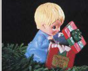
Open Me First