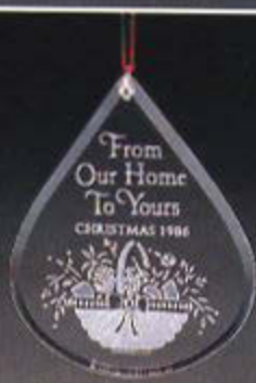
From Our Home to Yours