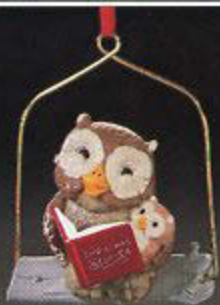
Happy Christmas to Owl