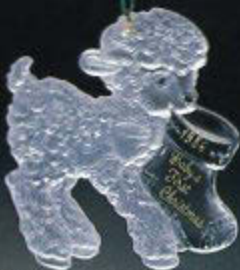
Baby's First Christmas