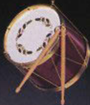
Favorite Tin Drum