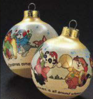
Shirt Tales™ Parade