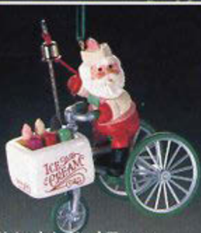
Kringle's Kool Treats 8th Ed.