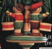
Little Drummers (real drumming motion)