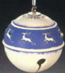
Holiday Jingle Bell (Musical: plays "Jingle Bells")