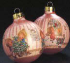
Betsey Clark: Home for Christmas, 1st Ed.