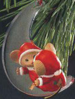
Mouse in the Moon