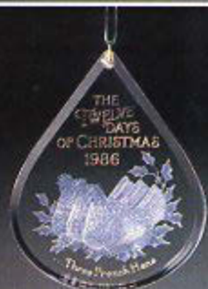
Three French Hens 3rd Ed.