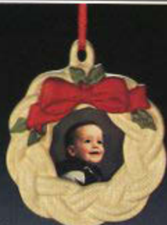
Memories to Cherish (photoholder)