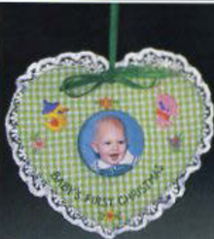
Baby's First Photoholder