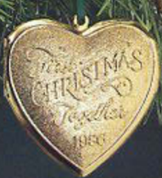
1st Christmas Locket

Show your feelings with an ornament as beautiful as the thought it expresses. Help newlyweds celebrate with a First Christmas Together ornament. It can help start a family tradition to last a lifetime.