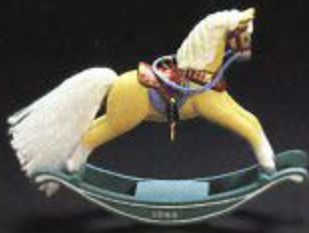
Rocking Horse, 6th Ed.