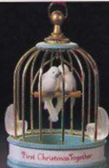
1st Christmas Together