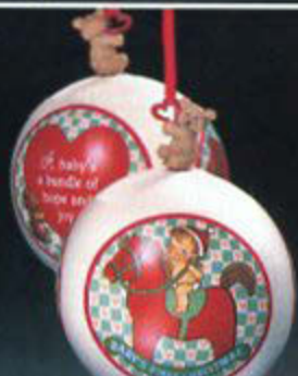
Baby's First Christmas