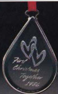
1st Christmas Together