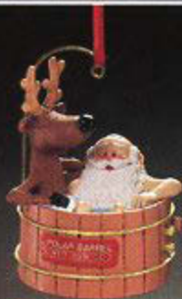
Santa's Hot Tub