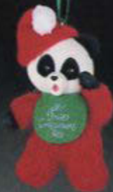
Child's Third Christmas

Christmas is for children. For those celebrating their first, start their collection with a Baby's First ornament. Continue their collections with Baby's Second and Child's Third ornaments for lifelong keepsakes.