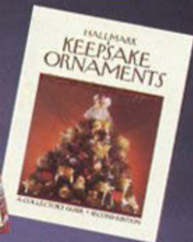
Hallmark Keepsake Ornament Collector's Guide — Second Edition