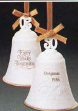
50 Years Together