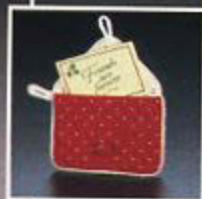
Friendship Greeting (includes note for personalization)