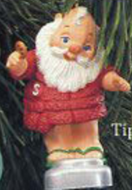
Tipping the Scales